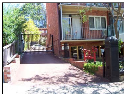
Accessible street entrance

Foyer: Tiled and level throughout. This area is shared with the café and there is ample circulation space for wheelchair of all sizes.