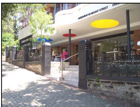
Main street entrance

Main entrance: Five steps to a wide, glass, manual swing door.