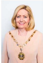
The Right Honourable The Lord Mayor Ms Lisa-M. Scaffidi