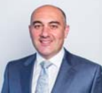
Cr James Limnios Deputy Lord Mayor