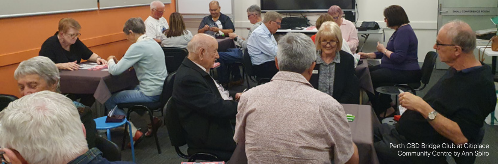
Perth CBD Bridge Club at Citiplace Community Centre