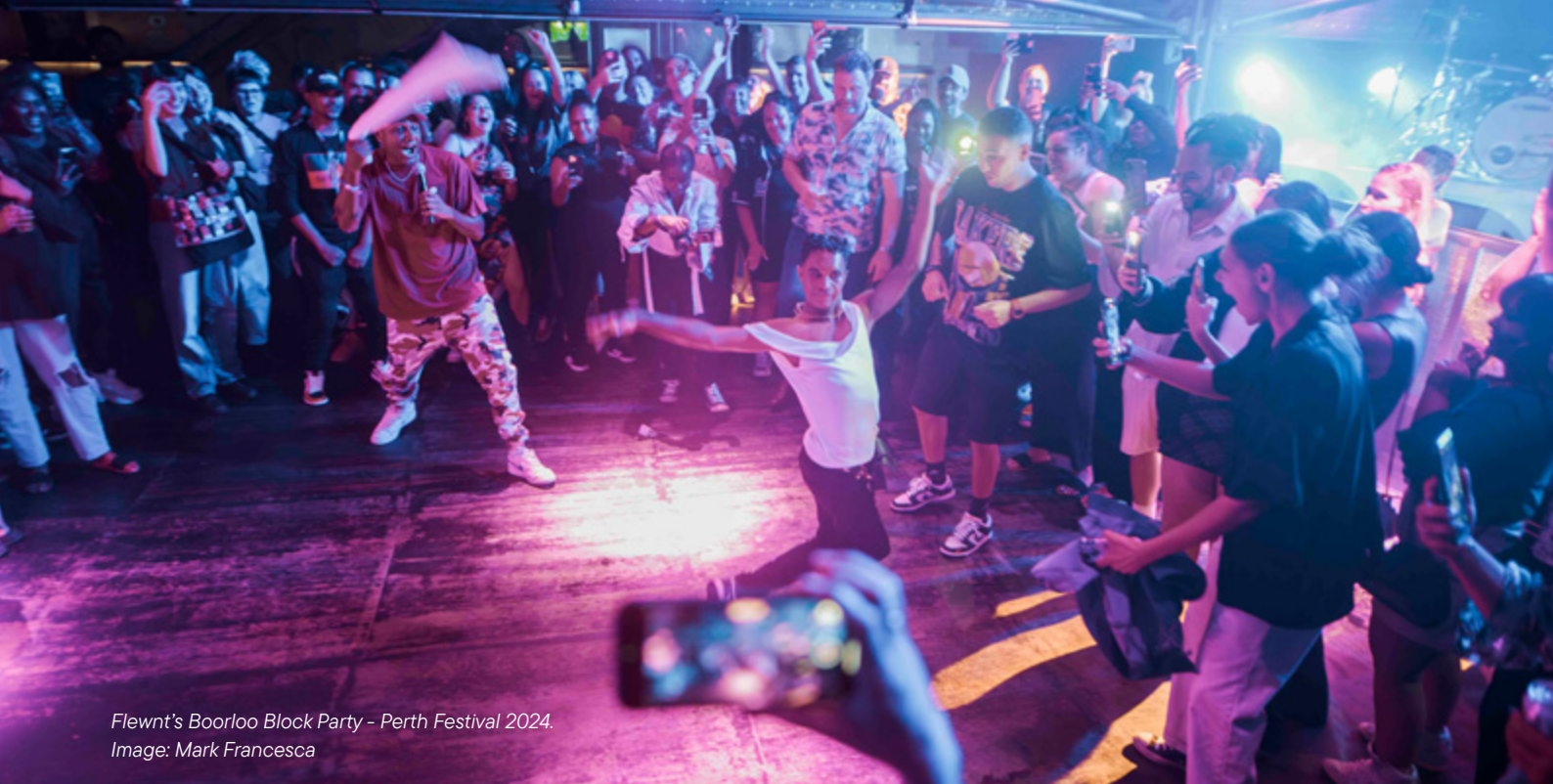
Flewnt's Boorloo Block Party - Perth Festival 2024.