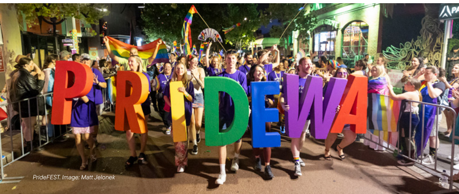
PrideFEST.