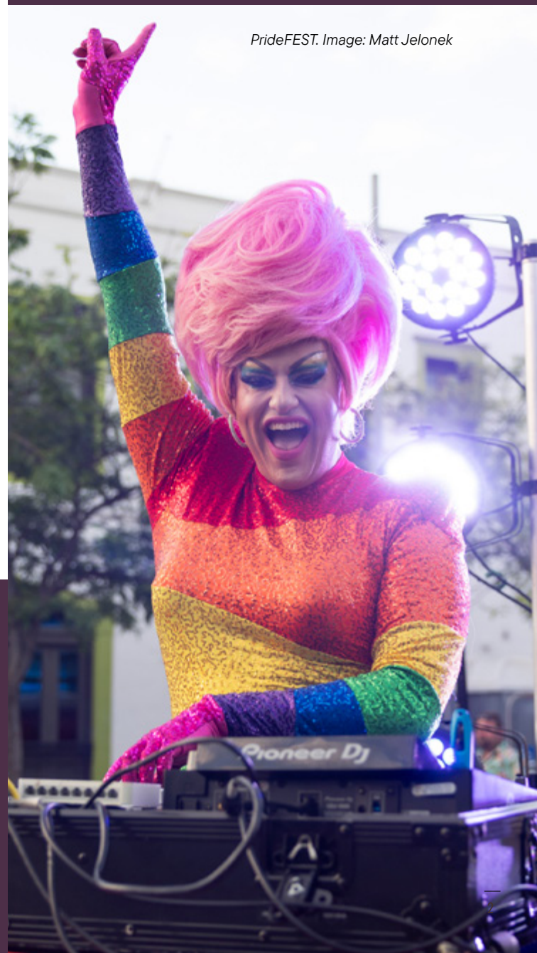
PrideFEST.