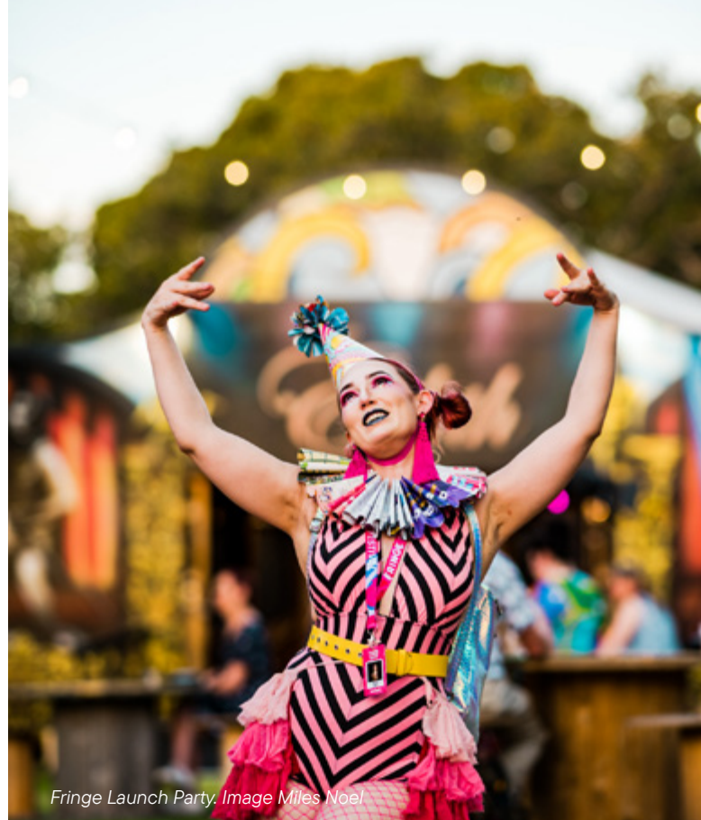
Fringe Launch Party.

A major event or festival will generate significant return on investment, economic impact and visitation outcomes, benchmarked against initiatives that have been previously supported under the program. Events will also provide significant sponsorship benefits in recognition of the City's support.