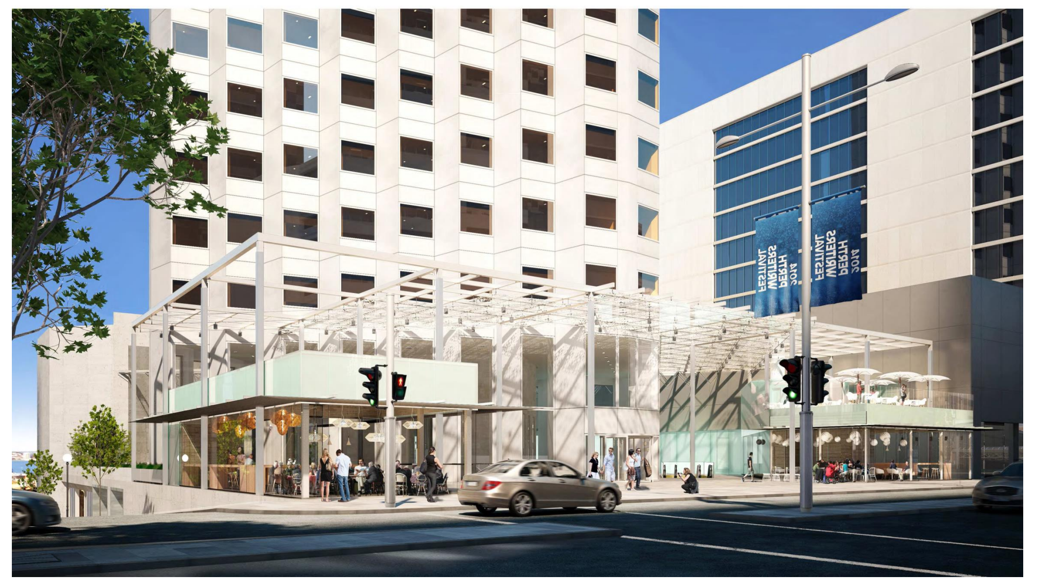
14/5555; 77 (LOT 50) ST GEORGES TERRACE, PERTH (PERSPECTIVE 2)