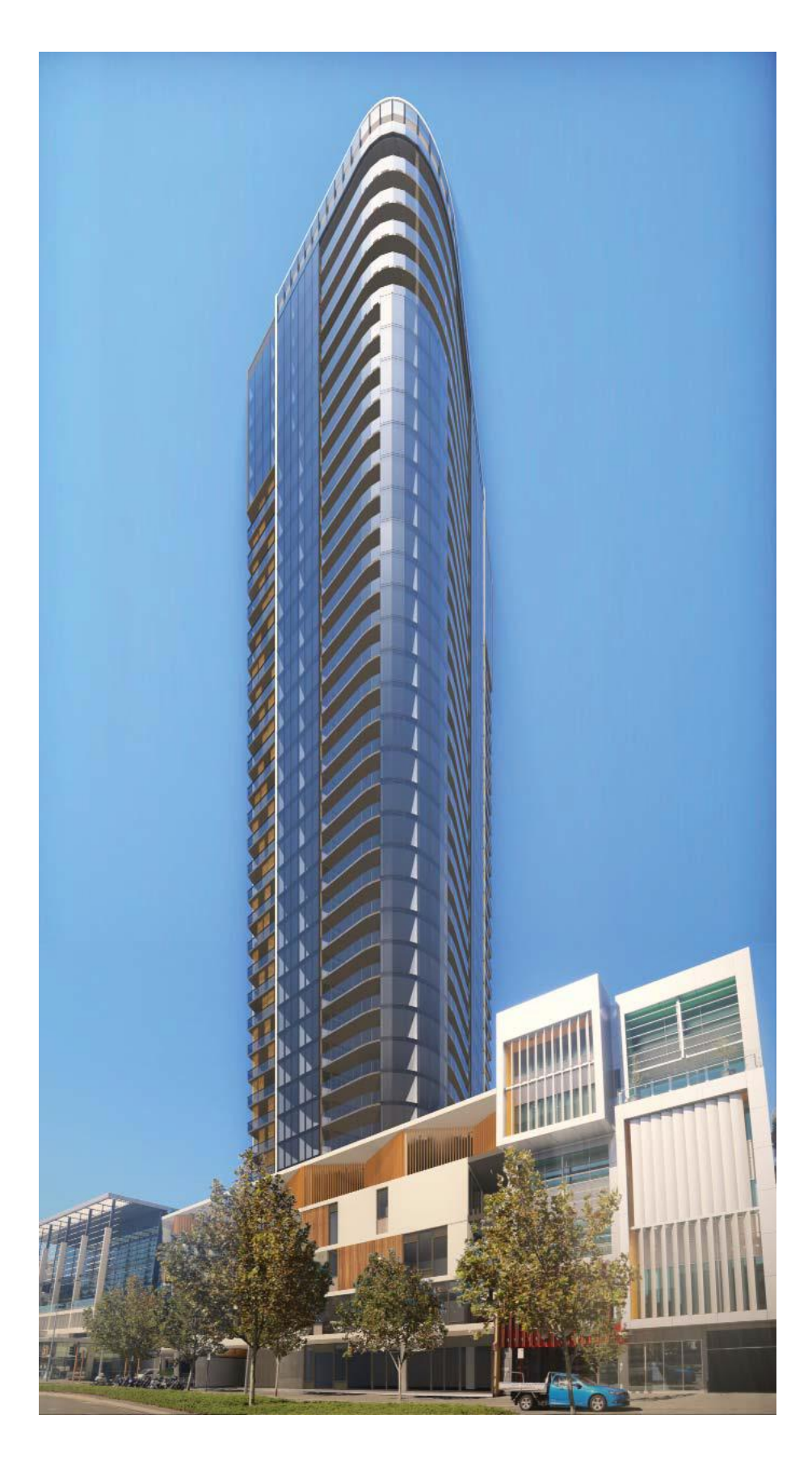
2015/5142; 108 (LOT 501) STIRLING STREET, PERTH