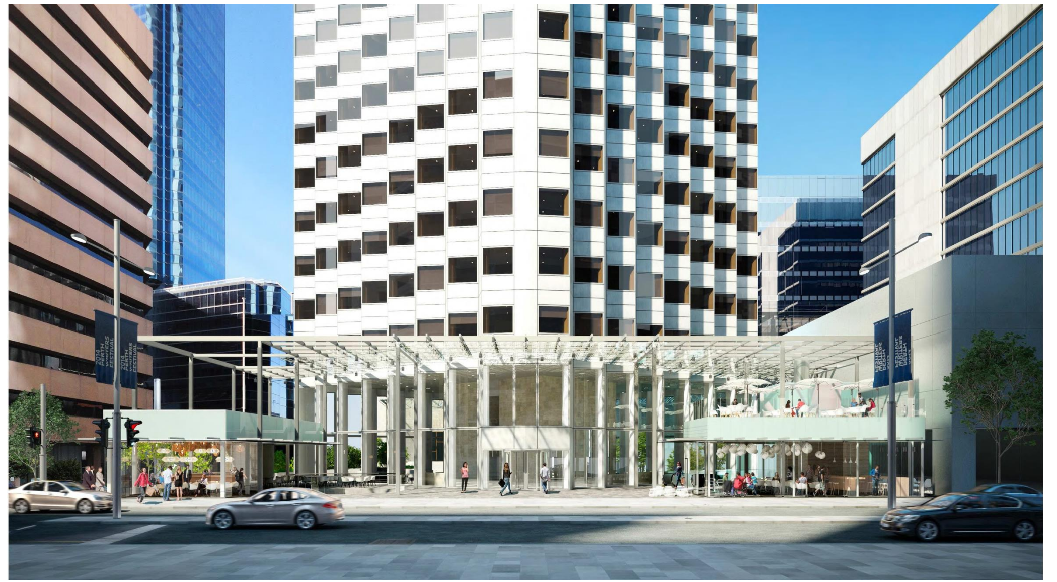
14/5555; 77 (LOT 50) ST GEORGES TERRACE, PERTH (PERSPECTIVE 1)