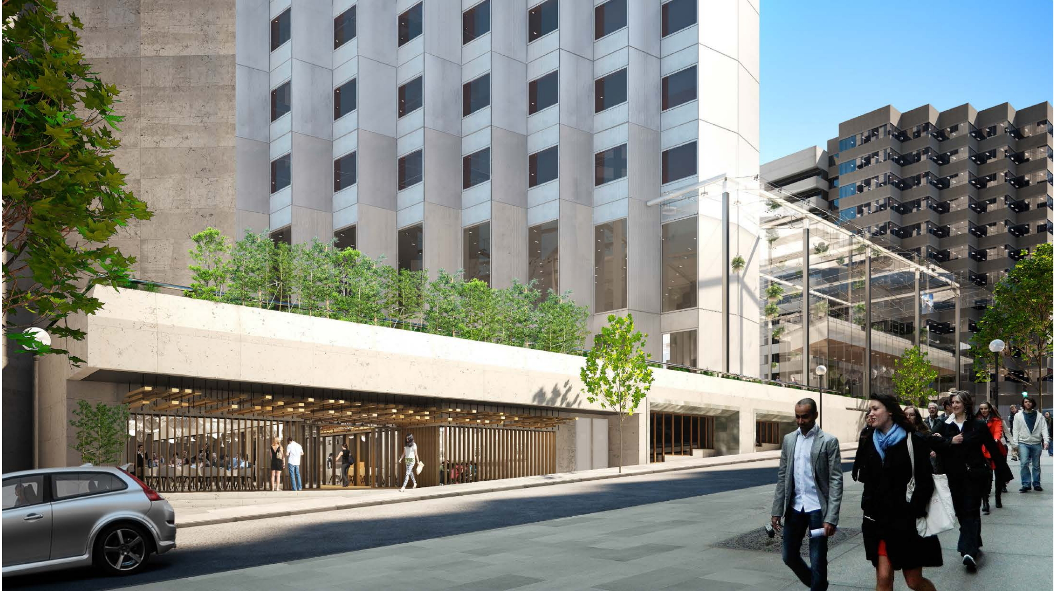
14/5555; 77 (LOT 50) ST GEORGES TERRACE, PERTH (PERSPECTIVE 3)