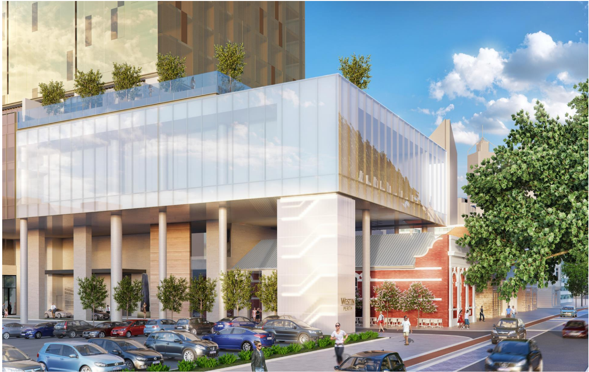
2014/5525: 480 HAY STREET AND 15-17 MURRAY STREET, PERTH (Note- modified fire escape not depicted)