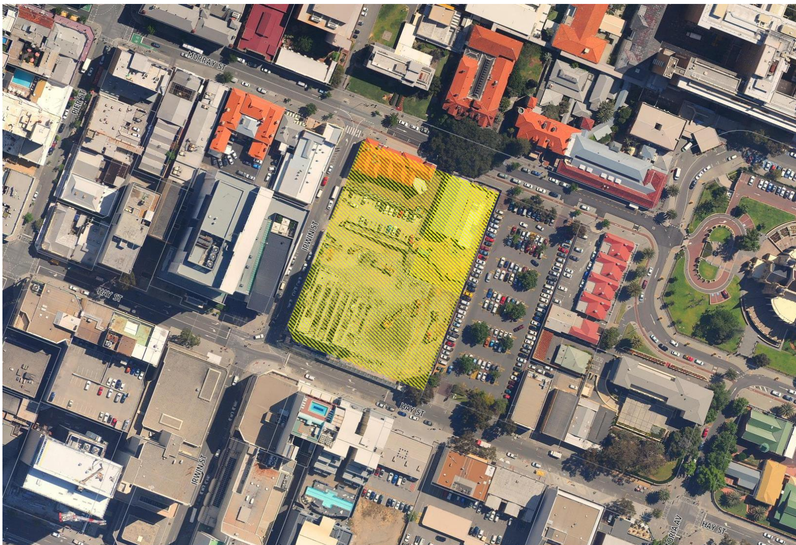
2014/5525: 480 HAY STREET AND 15-17 MURRAY STREET, PERTH