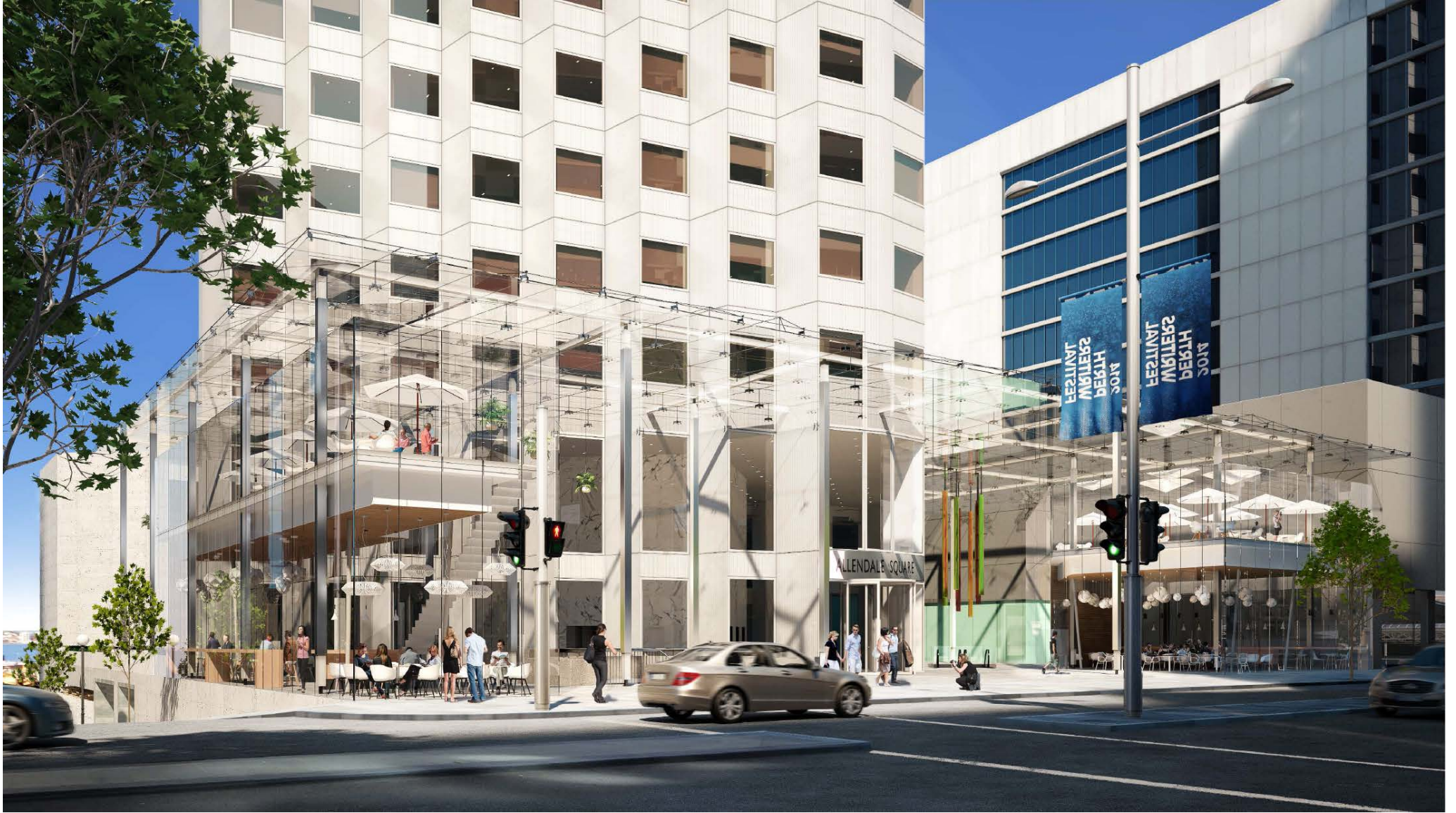
14/5555; 77 (LOT 50) ST GEORGES TERRACE, PERTH (PERSPECTIVE 2)