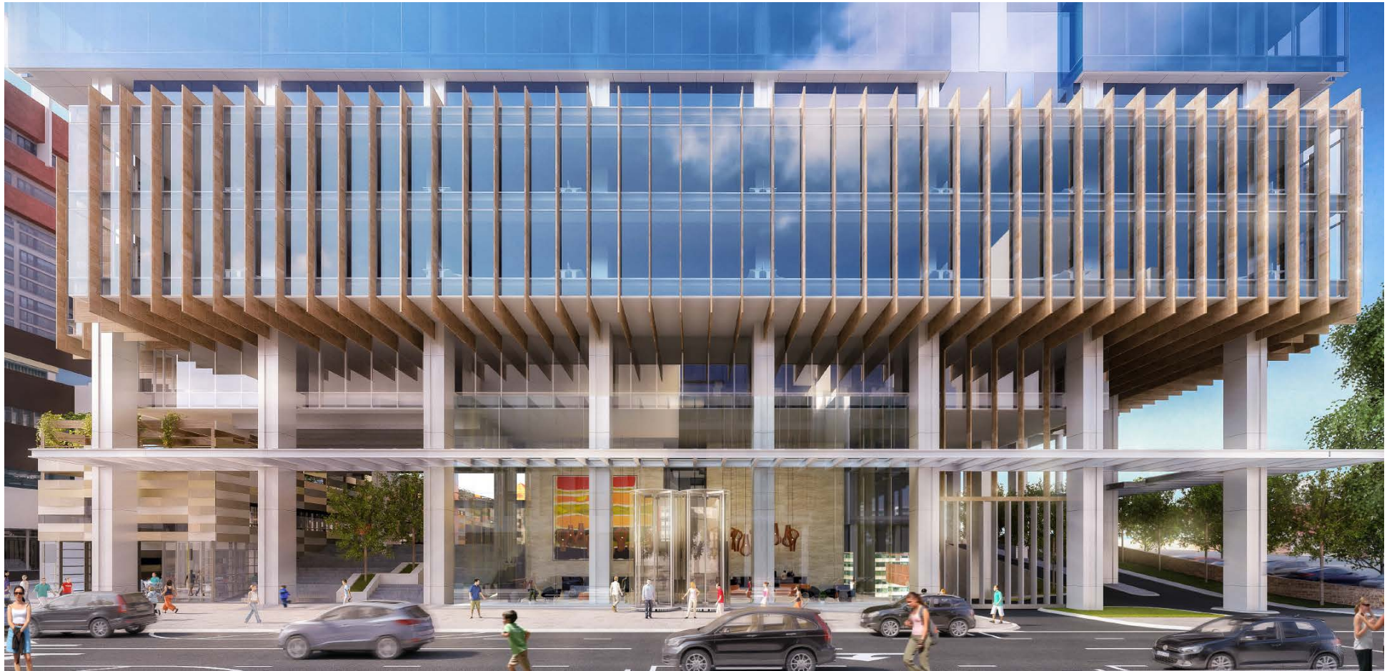
2014/5525: 480 HAY STREET AND 15-17 MURRAY STREET, PERTH (Note- modified crossover not depicted)