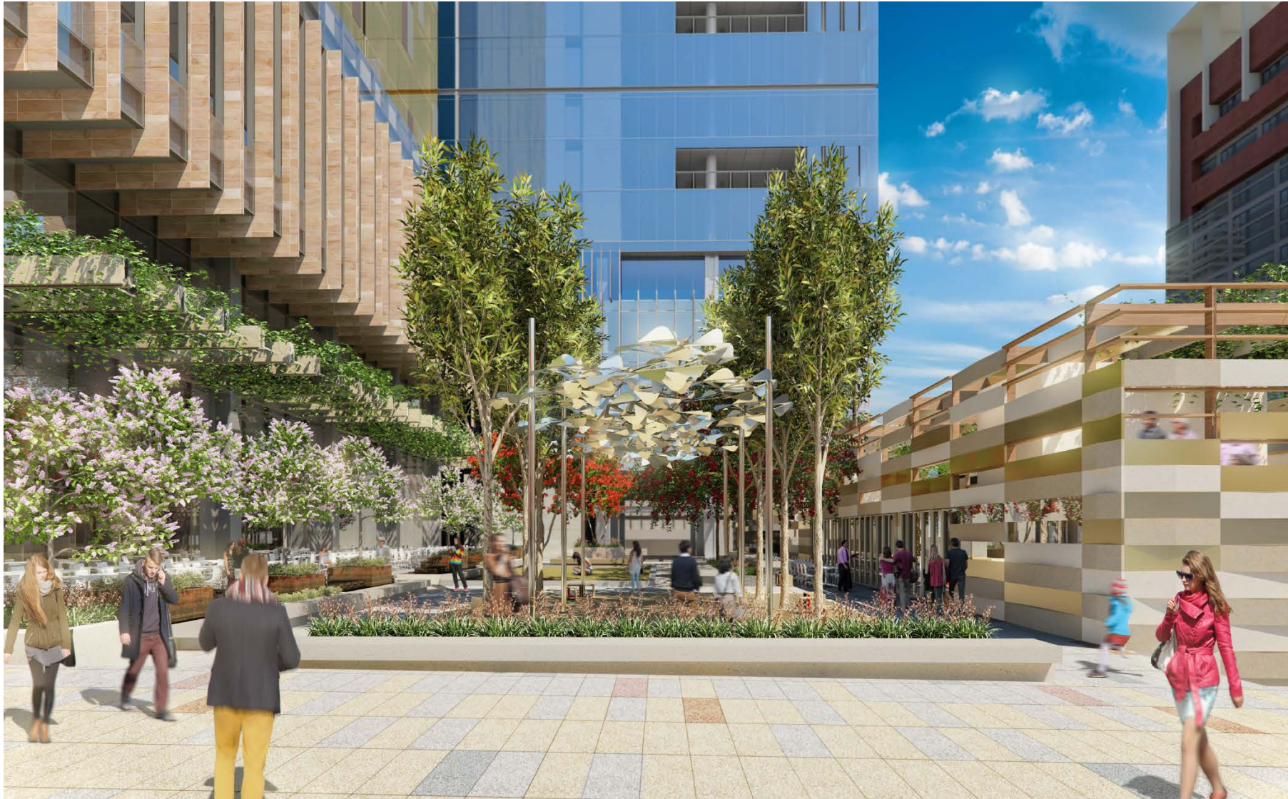
2014/5525: 480 HAY STREET AND 15-17 MURRAY STREET, PERTH