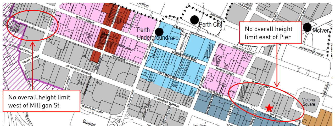
Extract from City Planning Scheme Maximum Building Heights Plan

The enclosed response to Item 3.3 contains commentary on the existing streetscape character. It is evident the character in this area is quite different to the section of Hay Street in the core of the City between Pier Street and Milligan Street. This is an important distinction to make, and is reflected in the Maximum Building Heights Plan of the CPS. As evident from the extract below, land on the north side of Hay Street, between Pier Street and Milligan Street, is subject to an overall height limit defined by a 45° angled height plane, in order to allow for high levels of sunlight penetration into the key east-west pedestrian spines of the City (Murray Street and James Street mall also being subject to the 45° angled height plane).