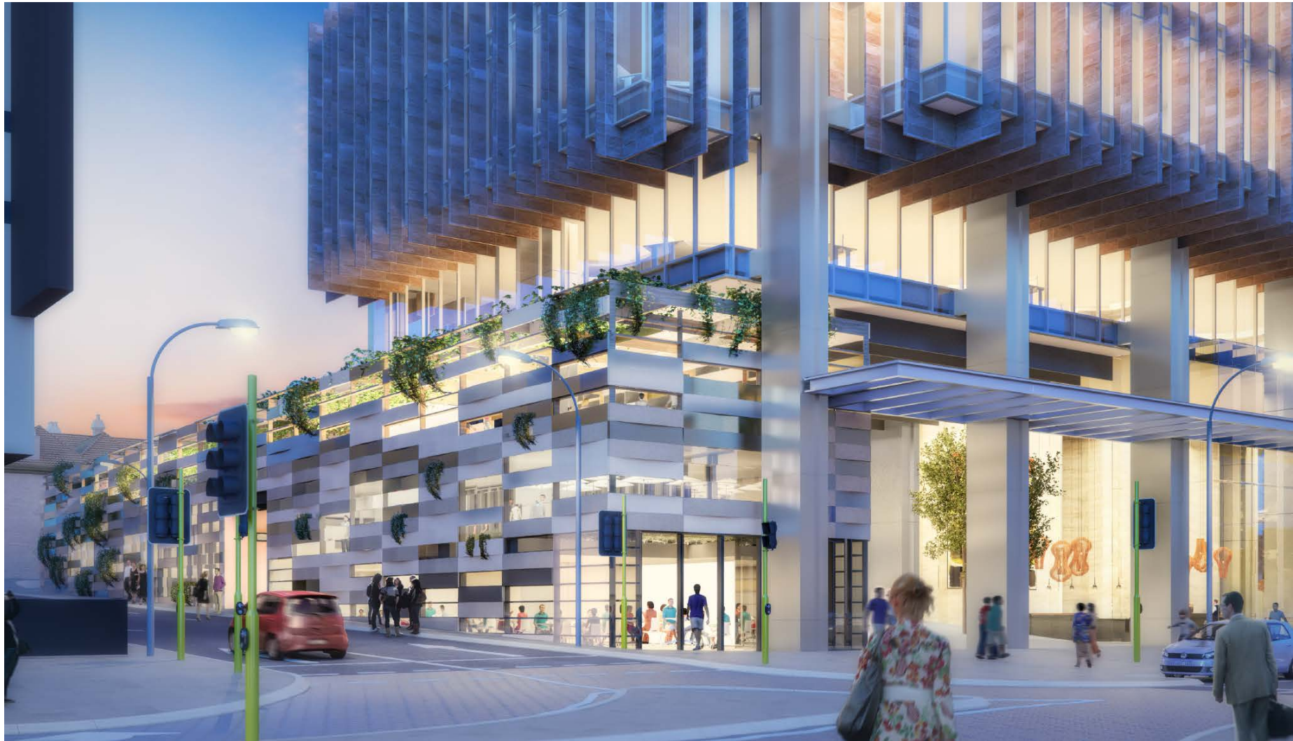
2014/5525: 480 HAY STREET AND 15-17 MURRAY STREET, PERTH