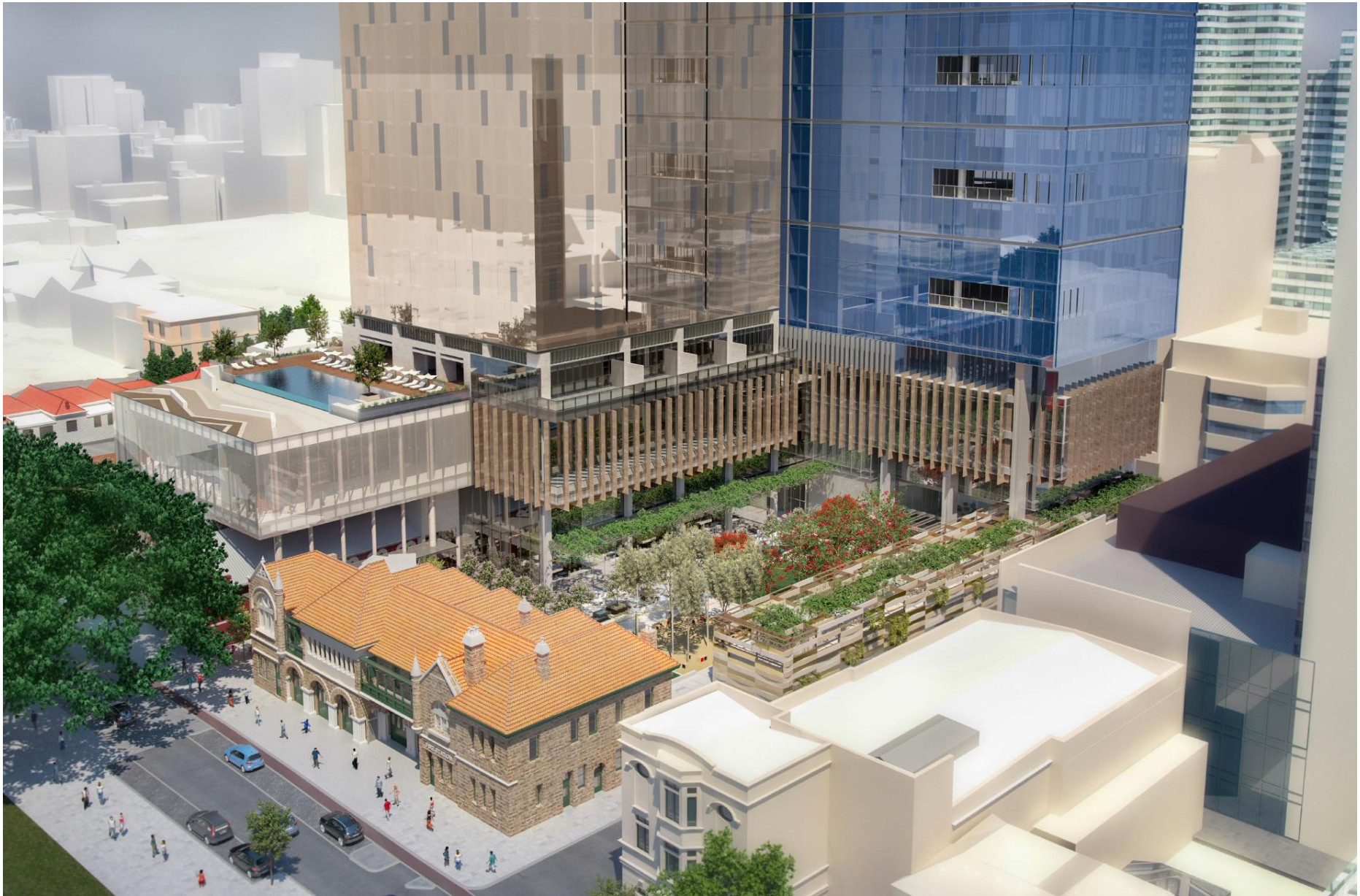
2014/5525: 480 HAY STREET AND 15-17 MURRAY STREET, PERTH