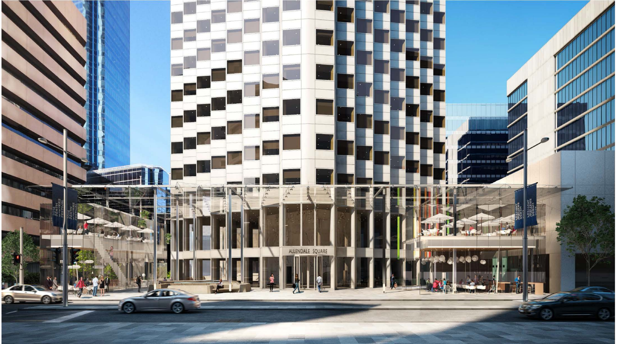
14/5555; 77 (LOT 50) ST GEORGES TERRACE, PERTH (PERSPECTIVE 1)