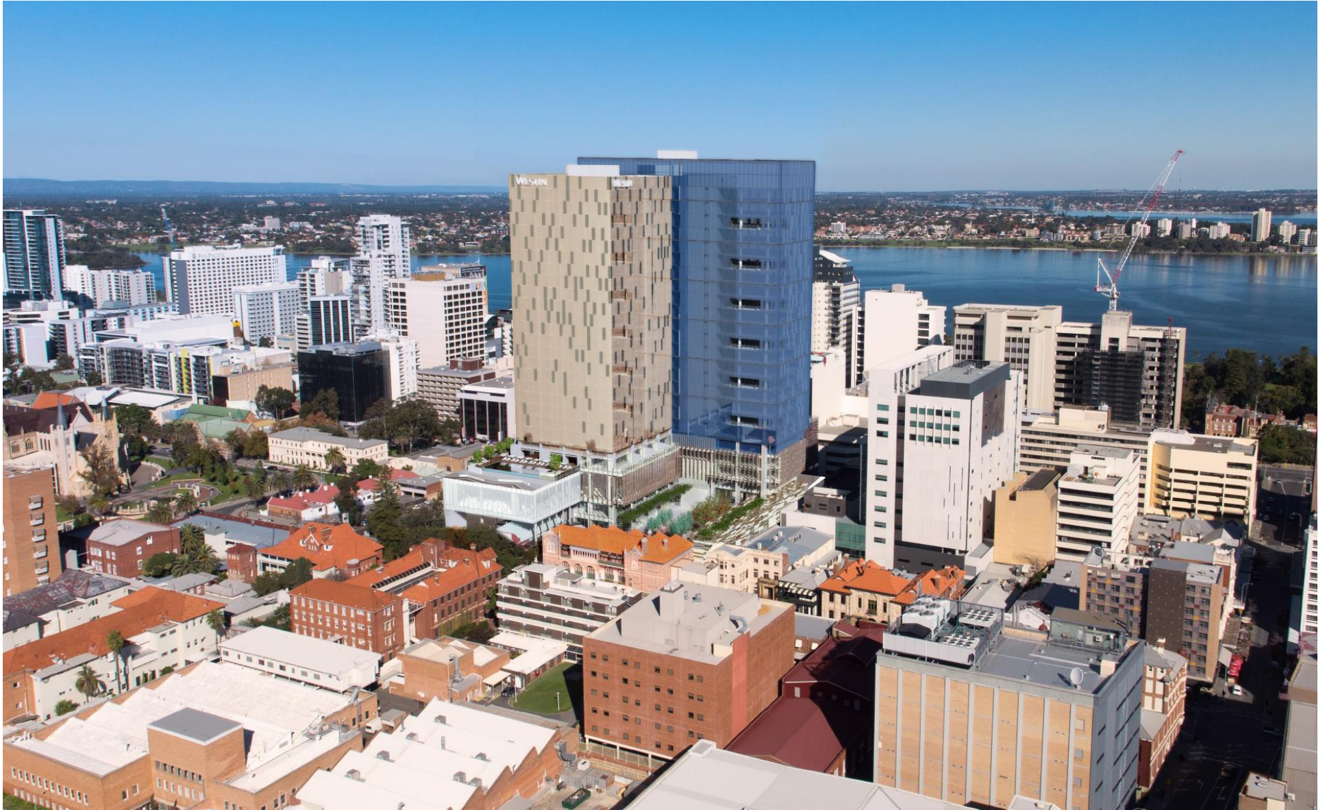
2014/5525: 480 HAY STREET AND 15-17 MURRAY STREET, PERTH