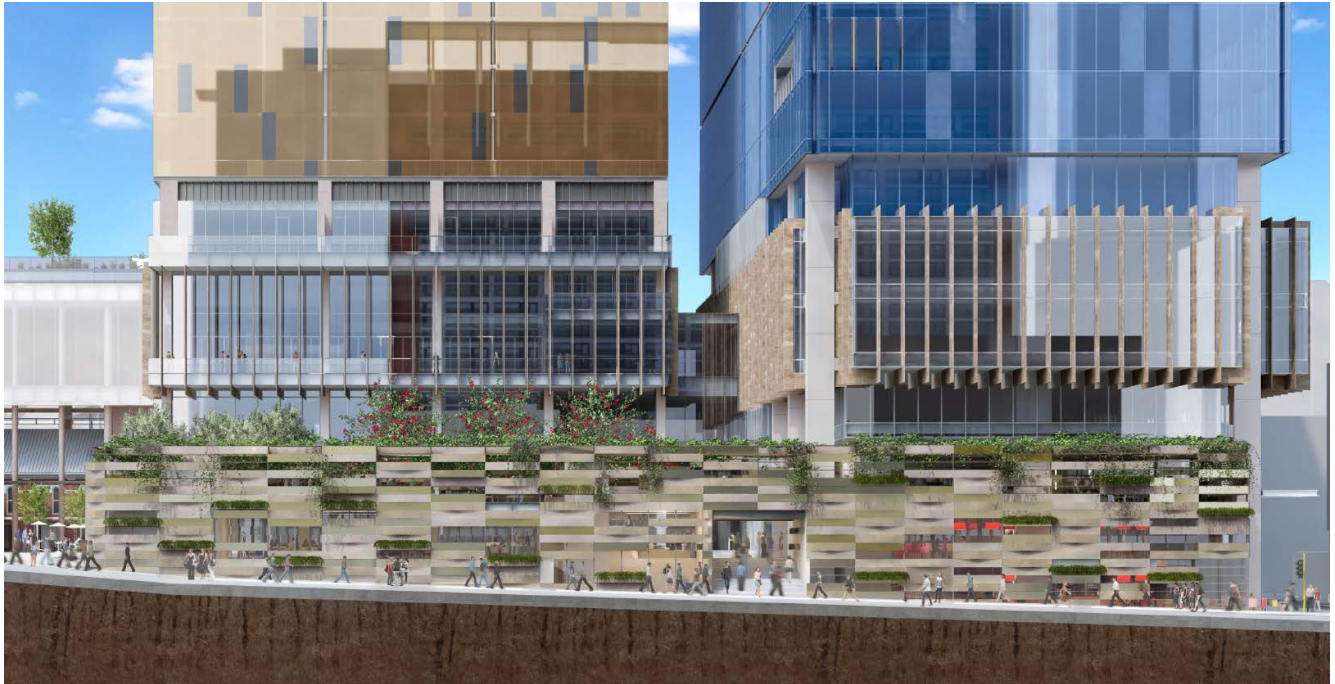
2014/5525: 480 HAY STREET AND 15-17 MURRAY STREET, PERTH