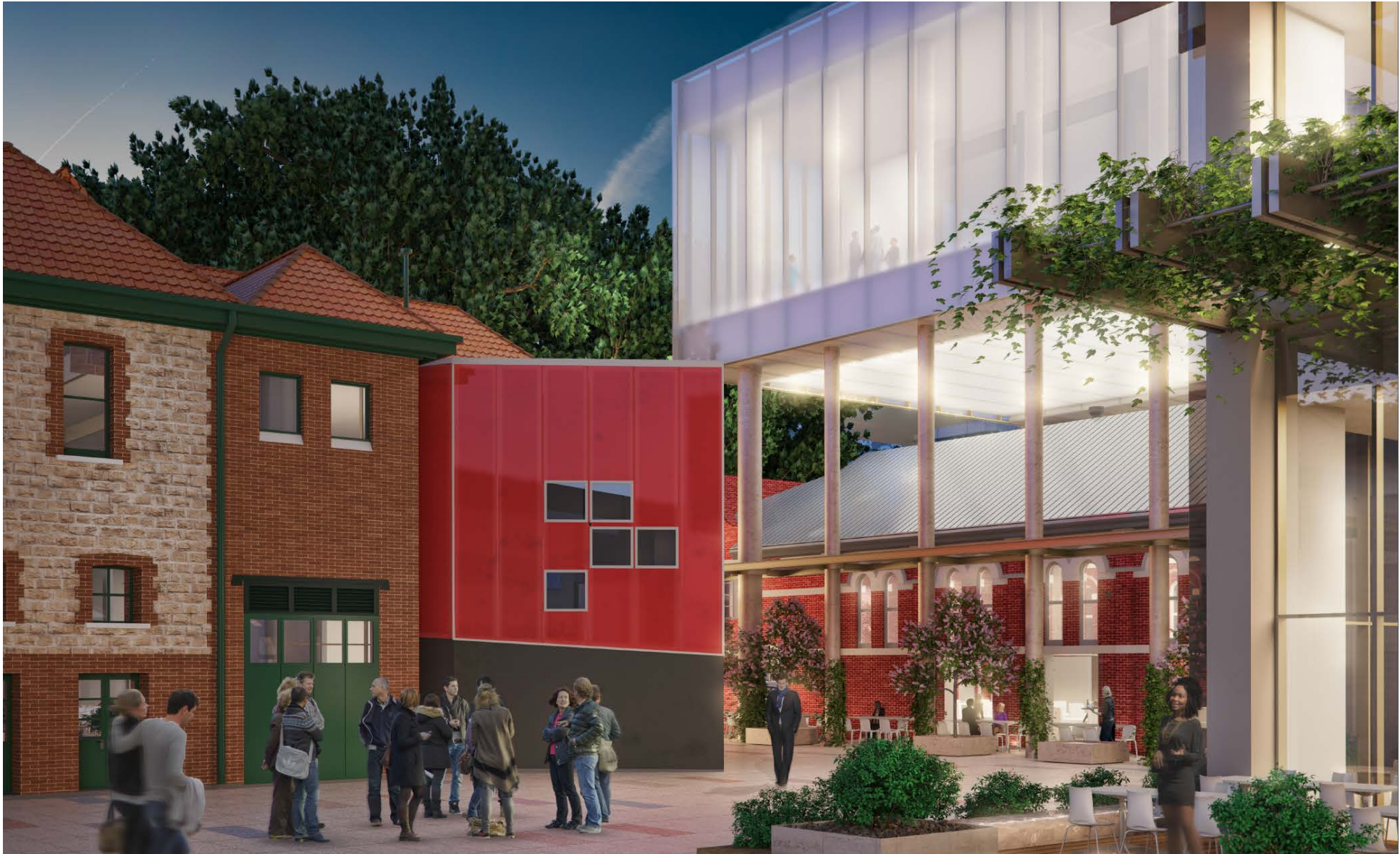
2014/5525: 480 HAY STREET AND 15-17 MURRAY STREET, PERTH