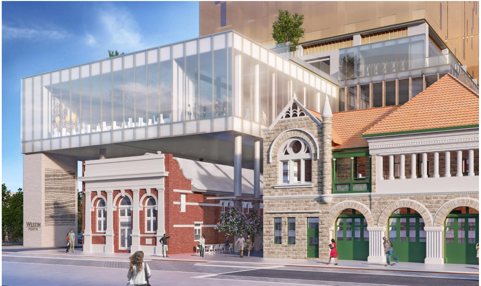
2014/5525: 480 HAY STREET AND 15-17 MURRAY STREET, PERTH (Note- modified fire escape not depicted)