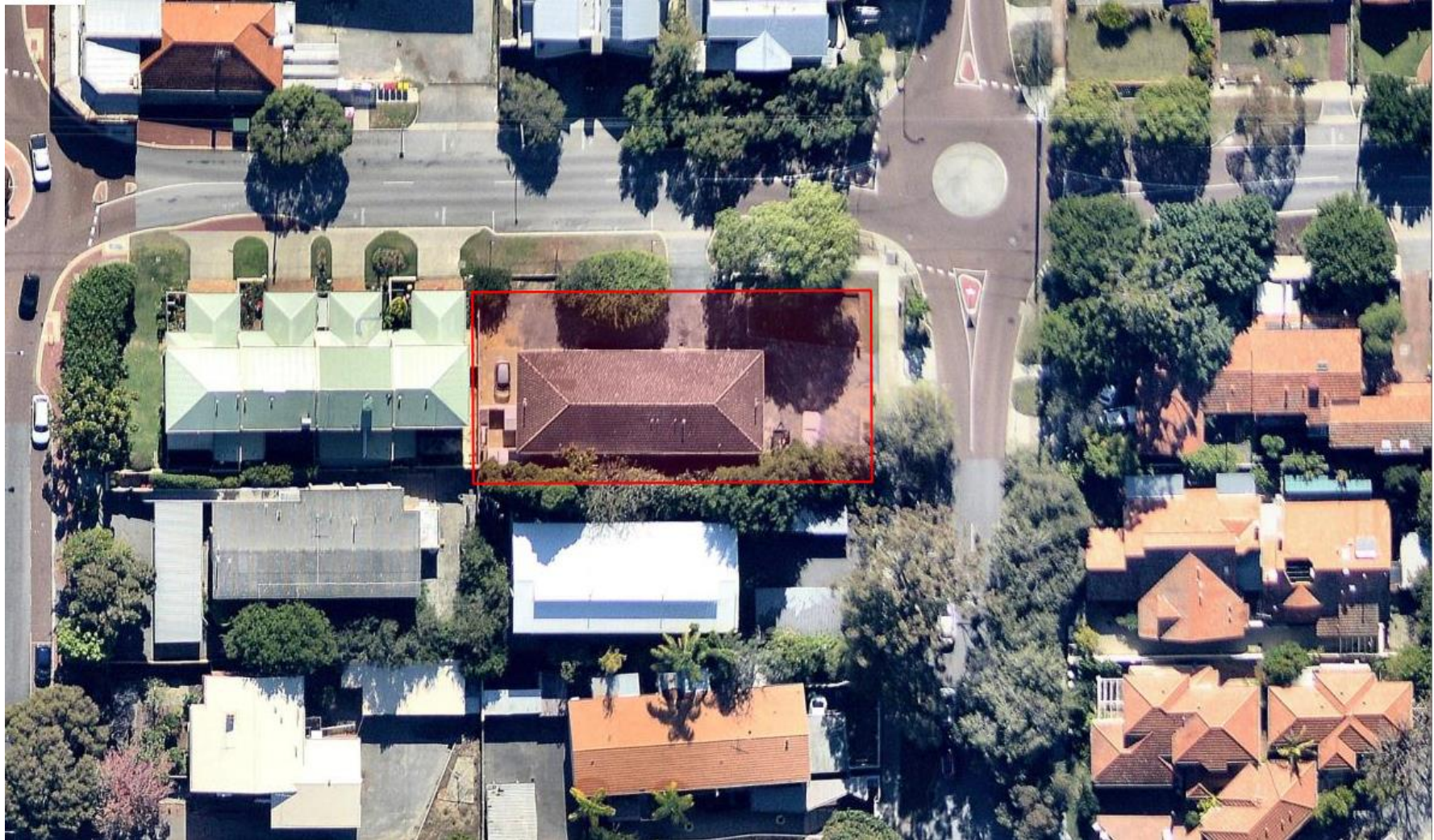
2017/5344; 147 (Lot 28) Fairway, Crawley