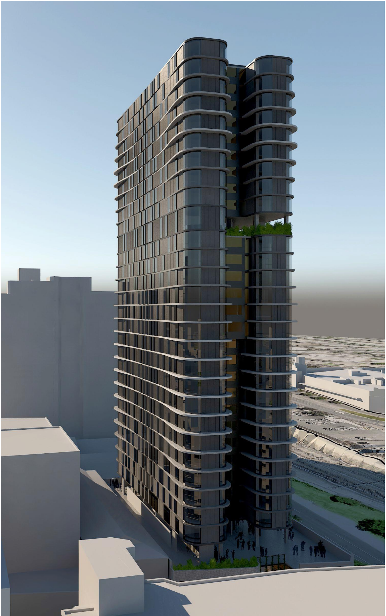
2017/5355 – 319-335 (LOTS 1, 2, 3, 66, 123 AND Q8) WELLINGTON STREET (PERSPECTIVES)