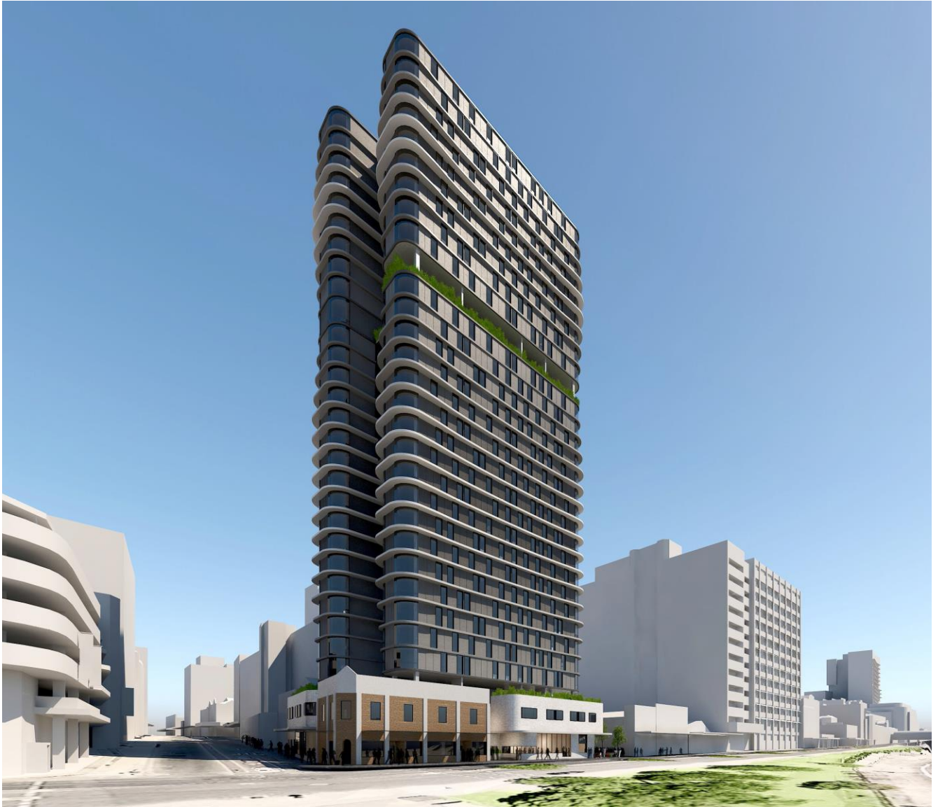
2017/5355 – 319-335 (LOTS 1, 2, 3, 66, 123 AND Q8) WELLINGTON STREET (PERSPECTIVES)