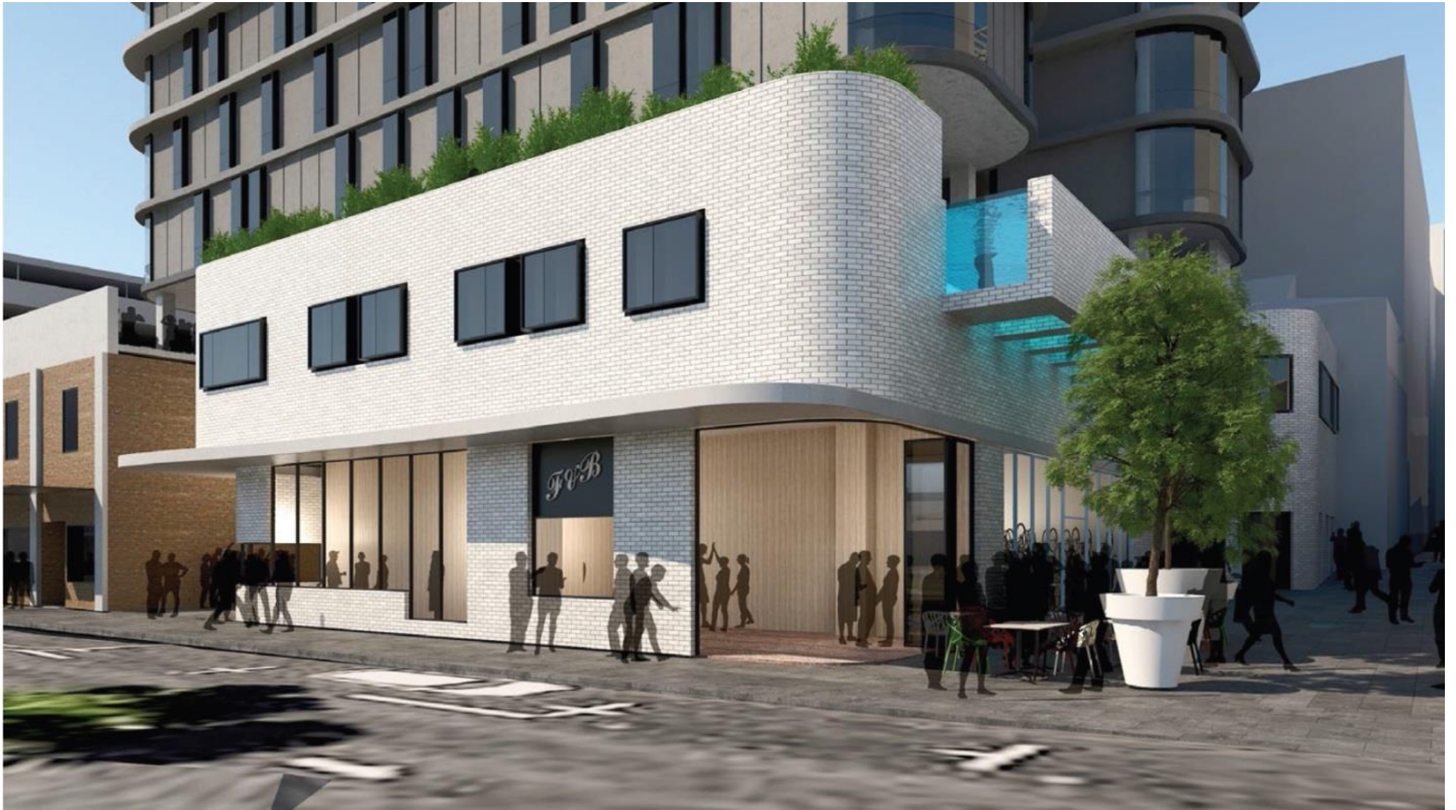
2017/5355 – 319-335 (LOTS 1, 2, 3, 66, 123 AND Q8) WELLINGTON STREET (PERSPECTIVES)