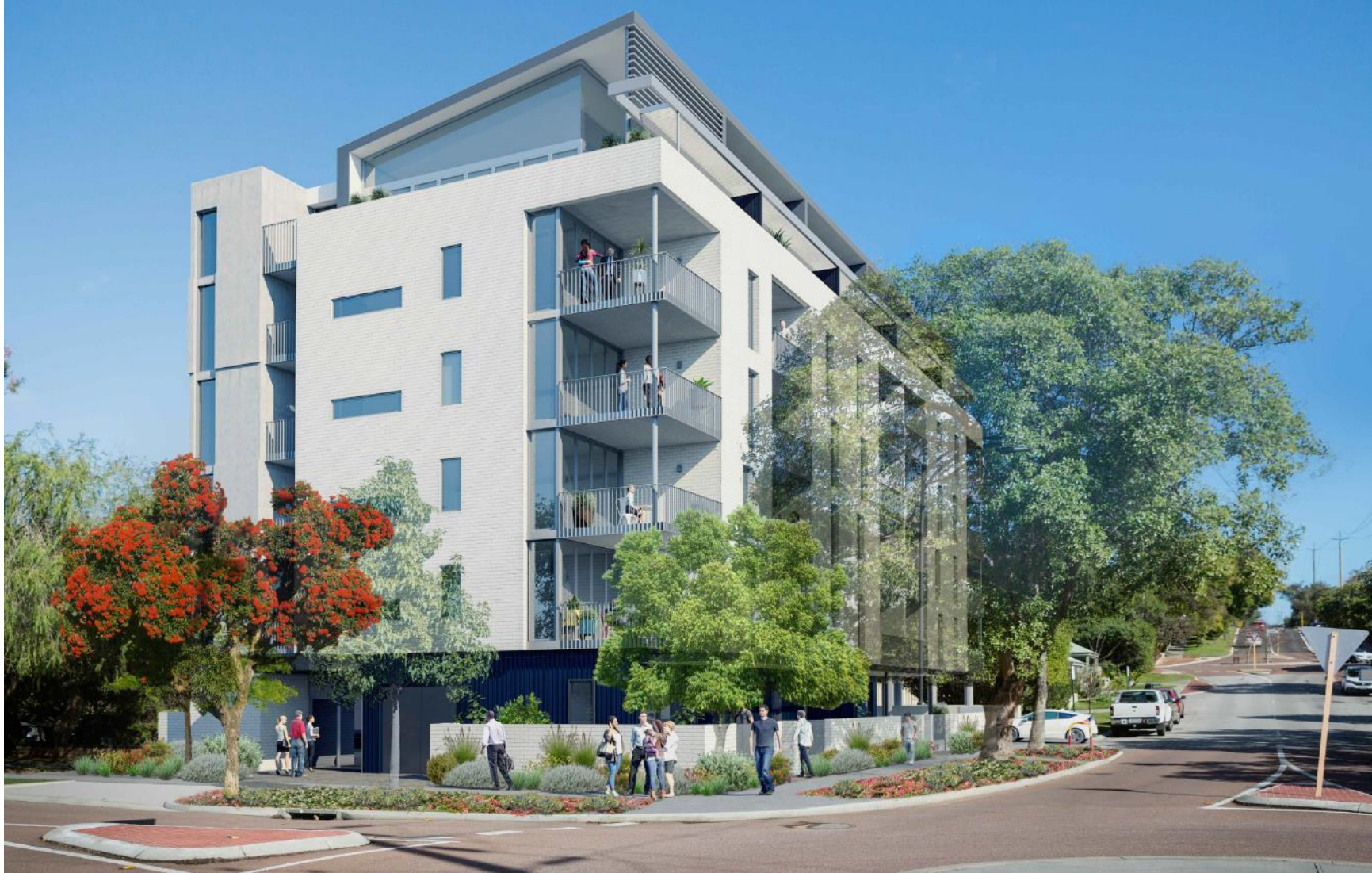
2017/5344; 147 (Lot 28) Fairway, Crawley