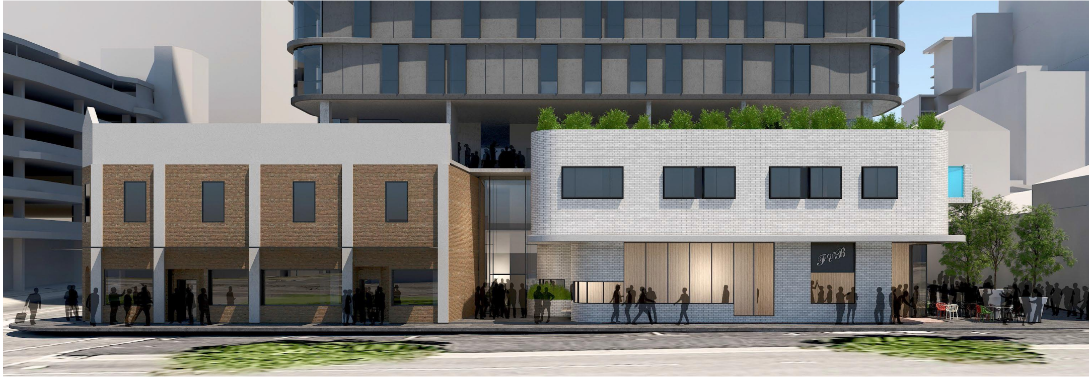
2017/5355 – 319-335 (LOTS 1, 2, 3, 66, 123 AND Q8) WELLINGTON STREET (PERSPECTIVES)