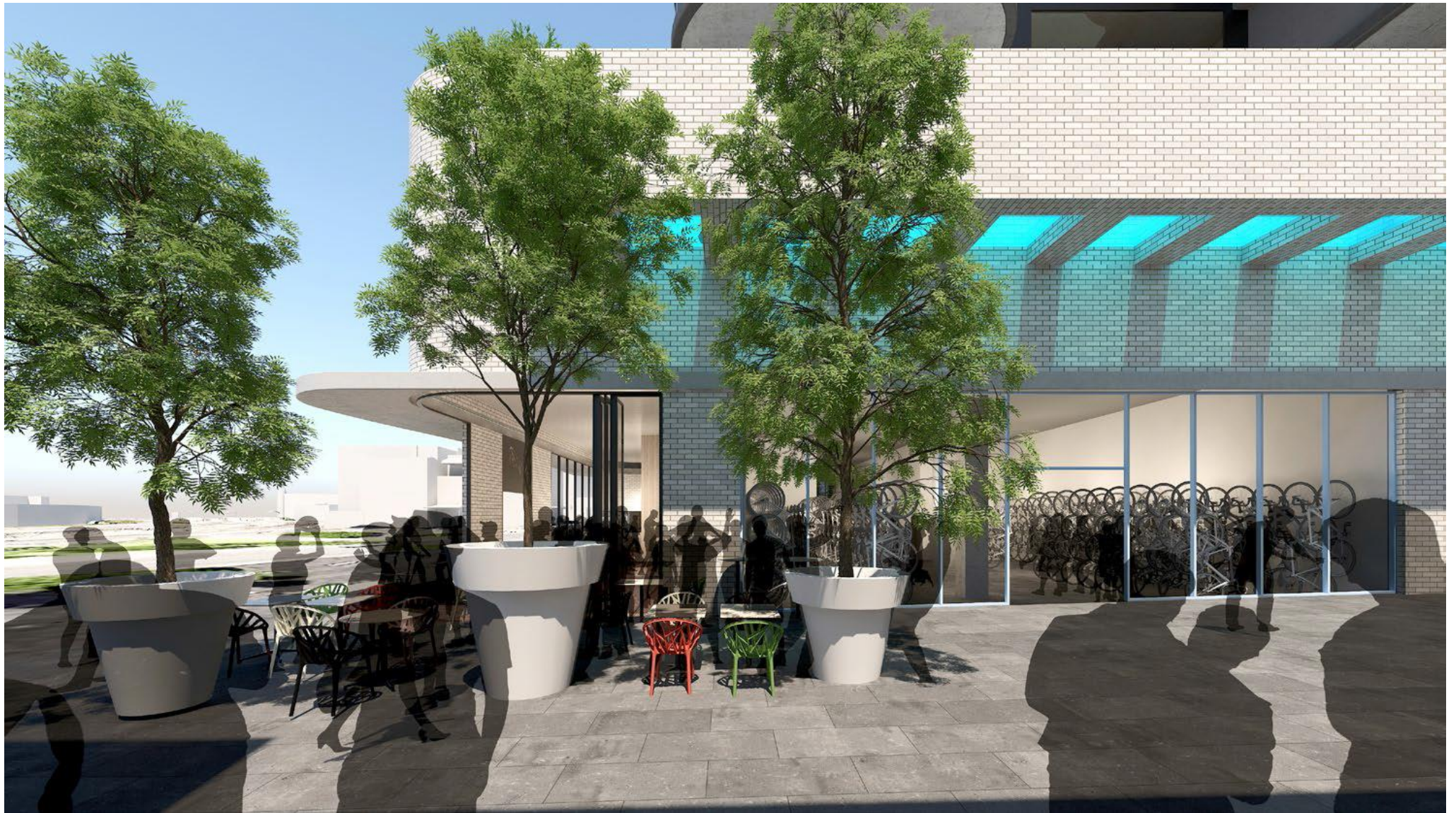
2017/5355 – 319-335 (LOTS 1, 2, 3, 66, 123 AND Q8) WELLINGTON STREET (PERSPECTIVES)