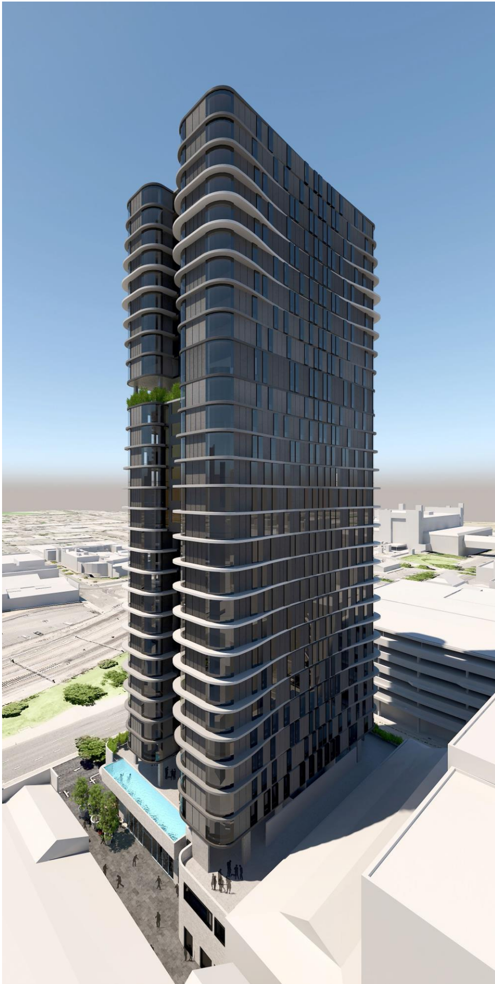
2017/5355 – 319-335 (LOTS 1, 2, 3, 66, 123 AND Q8) WELLINGTON STREET (PERSPECTIVES)