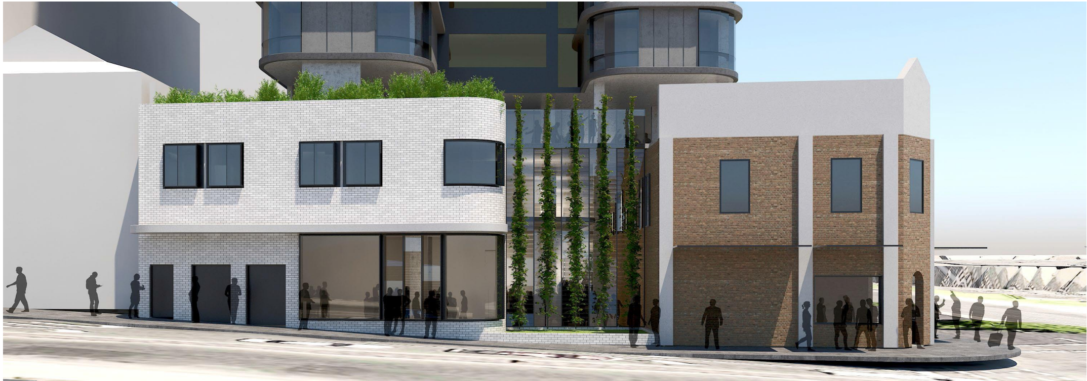
2017/5355 – 319-335 (LOTS 1, 2, 3, 66, 123 AND Q8) WELLINGTON STREET (PERSPECTIVES)