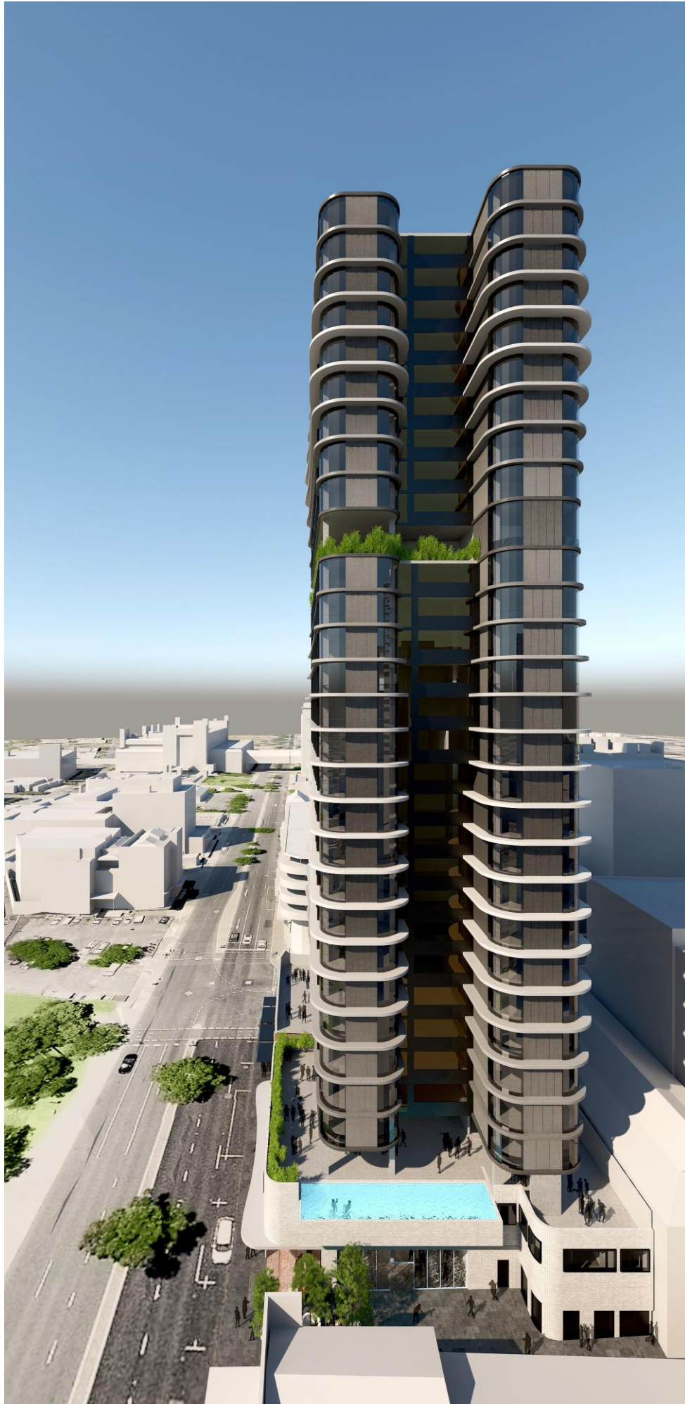
2017/5355 – 319-335 (LOTS 1, 2, 3, 66, 123 AND Q8) WELLINGTON STREET (PERSPECTIVES)