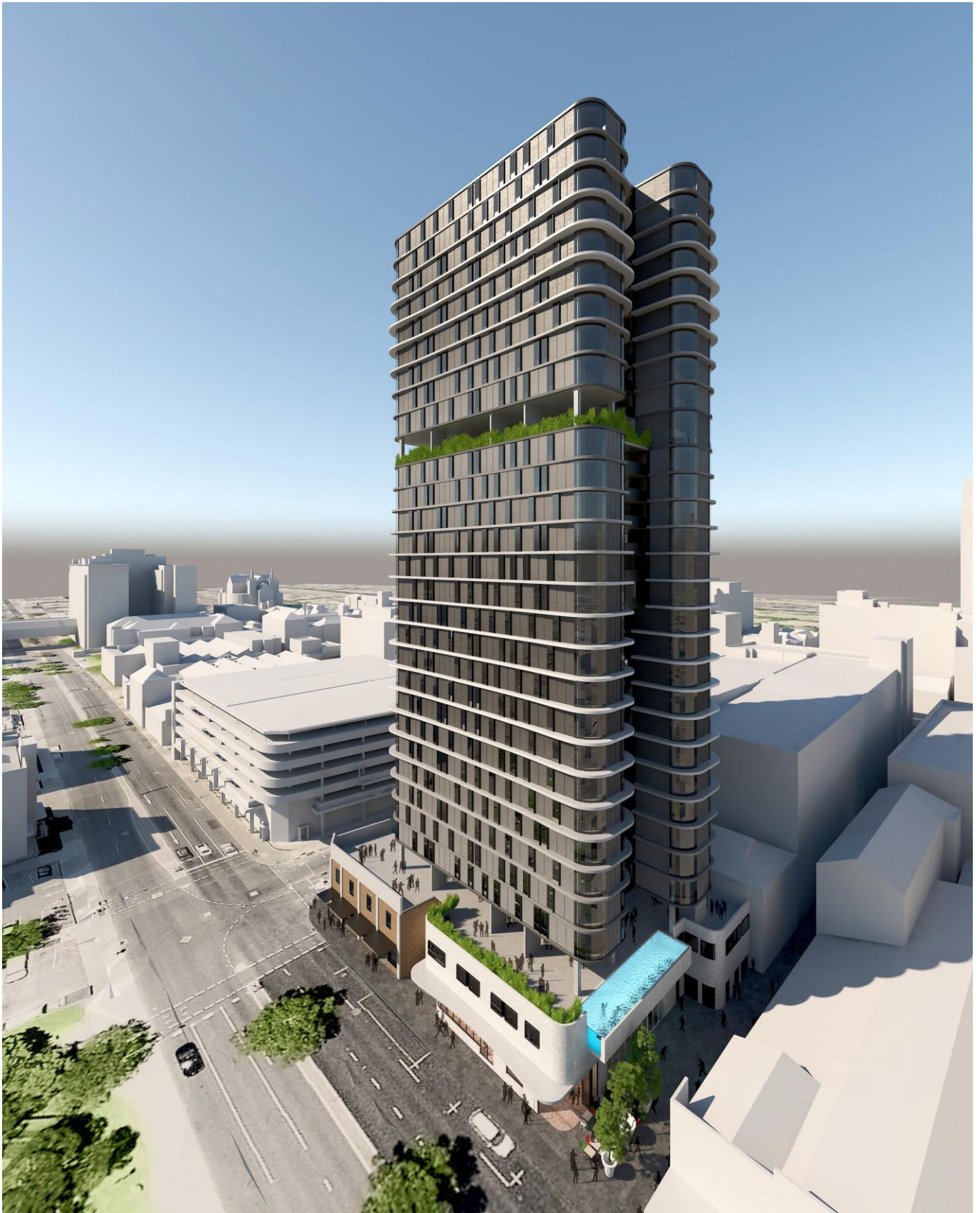
2017/5355 – 319-335 (LOTS 1, 2, 3, 66, 123 AND Q8) WELLINGTON STREET (PERSPECTIVES)