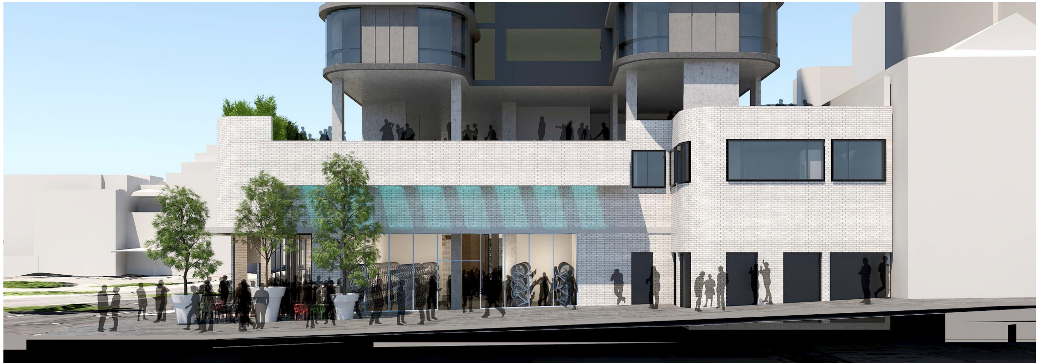
2017/5355 – 319-335 (LOTS 1, 2, 3, 66, 123 AND Q8) WELLINGTON STREET (PERSPECTIVES)