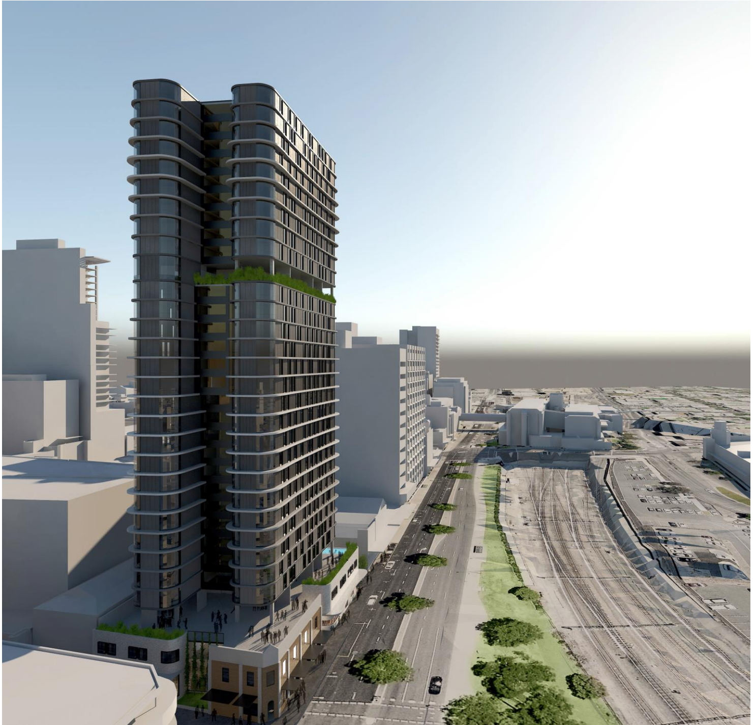
2017/5355 – 319-335 (LOTS 1, 2, 3, 66, 123 AND Q8) WELLINGTON STREET (PERSPECTIVES)