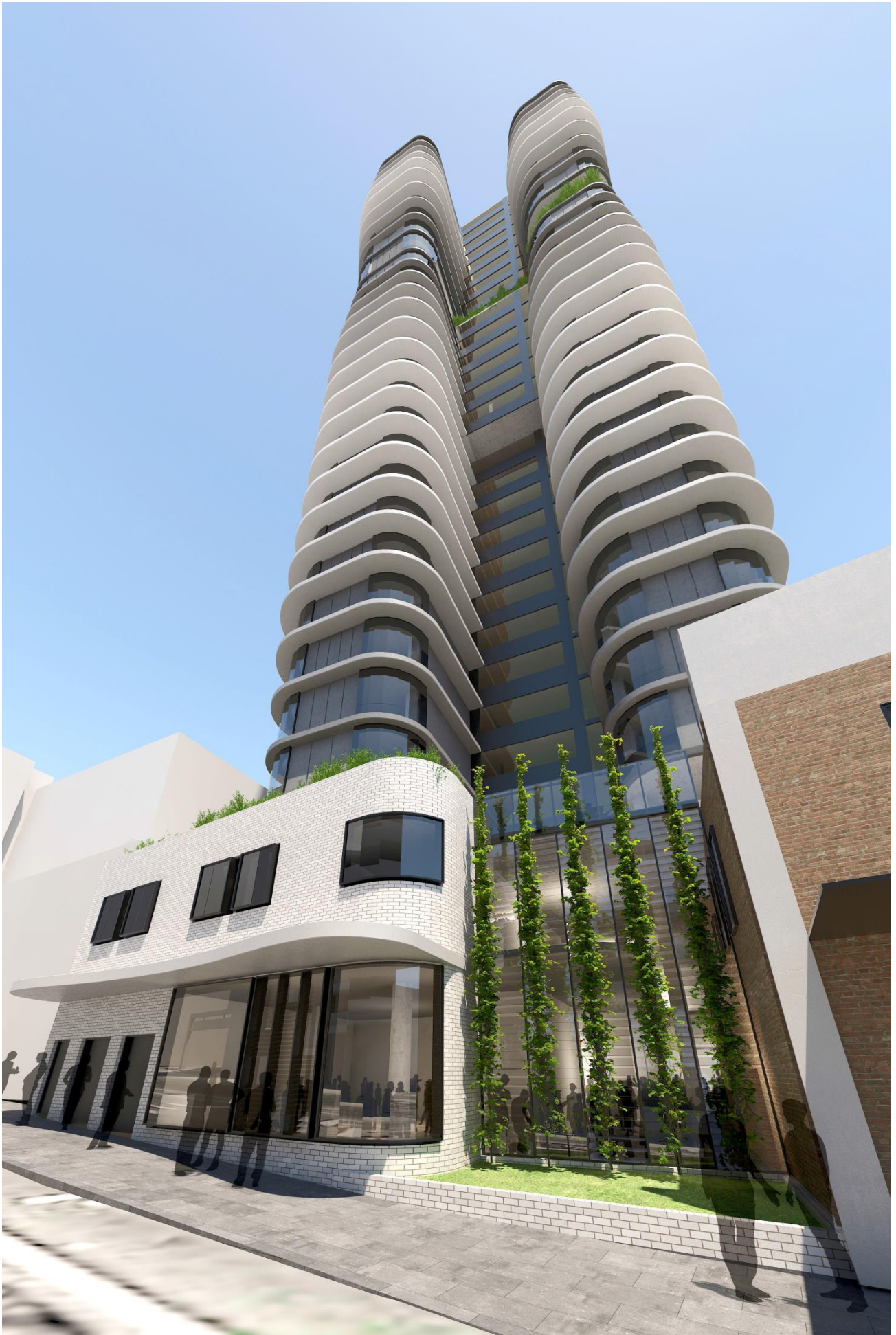
2017/5355 – 319-335 (LOTS 1, 2, 3, 66, 123 AND Q8) WELLINGTON STREET (PERSPECTIVES)