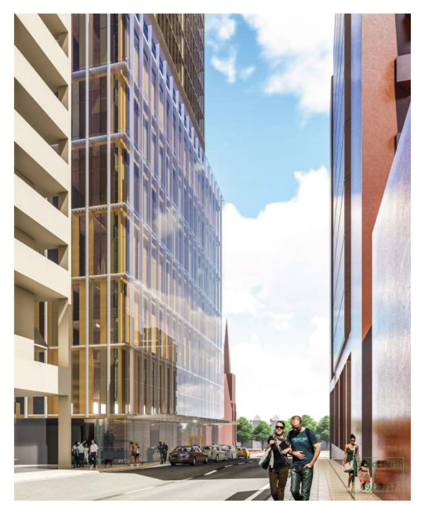
2017/5515 36 (LOT 18) ST GEORGES TERRACE & 10 – 14 (LOT 19) PIER STREET & LOT 50 ON PLAN 7042, PERTH