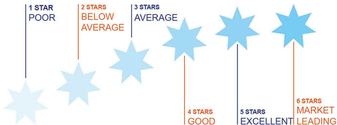
Figure 1. NABERS Star Rating Scale. A green building is regarded as having a rating of four stars and above.