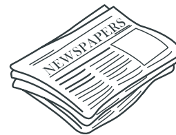
PAPERS & MAGAZINES (excluding shredded paper)