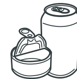
ALUMINIUM & STEEL CANS