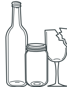
GLASS BOTTLES & JARS (including broken glass)